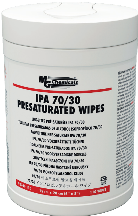
8241-110 (110 Wipes)

8241-110 (110 Wipes) - IPA 70/30 Presaturated Wipes