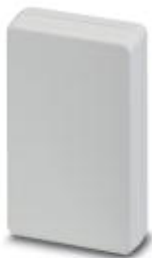
Handheld housing, C-Mini, light gray, front level closed, consisting of two half shells with screws

Please be informed that the data shown in this PDF Document is generated from our Online Catalog. Please find the complete data in the user's documentation. Our General Terms of Use for Downloads are valid ( http://phoenixcontact.com/download )