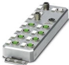
Axioline E PROFIBUS device in a metal housing with 8 IO-Link ports and 4 digital inputs, 24 V DC, M12 fast connection technology

Please be informed that the data shown in this PDF Document is generated from our Online Catalog. Please find the complete data in the user's documentation. Our General Terms of Use for Downloads are valid ( http://phoenixcontact.com/download )