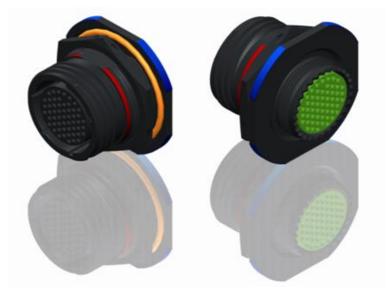
LAYOUT SHOWN AS EXAMPLE