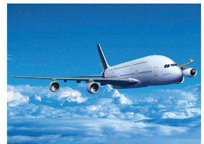
Accepted for use by major aircraft manufacturers.