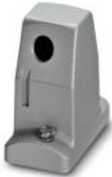
HEAVYCON ADVANCE EMV sleeve housing B6, with screw locking, height 100 mm, with 1xM20 thread, lateral cable outlet

Please be informed that the data shown in this PDF Document is generated from our Online Catalog. Please find the complete data in the user's documentation. Our General Terms of Use for Downloads are valid ( http://download.phoenixcontact.com )