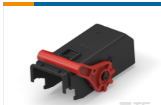
TE Part #2360002-1 REC CONN CVR ASSY, 96 POS, AMP MCP 2.8