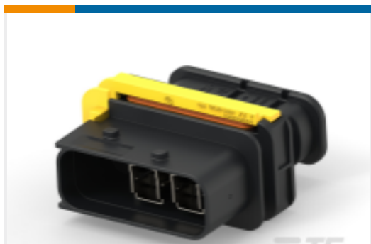
TE Part #9-2348782-1 HD MATEnet 2+6 TAB HSG ASSY, GRP E