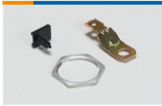
Other Automotive Connector Accessories(16)