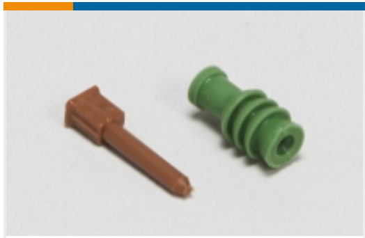
Automotive Seals & Cavity Plugs(5)