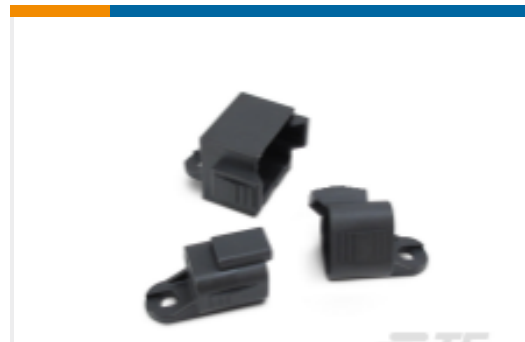
TE Part #1011-349-1205 Dust Caps — DEUTSCH DT