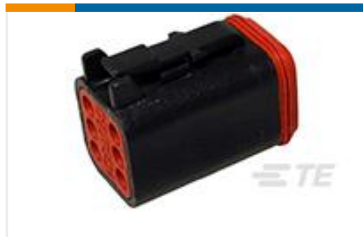
TE Part #DT06-6S-P012 PLG, 6P, BLK, N, SEAL RET