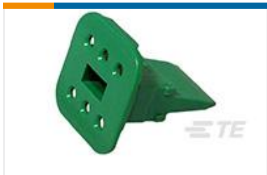
TE Part #W6S-P012 WEDGE LOCK, 6P, PLG, GRN, SL RET, DT