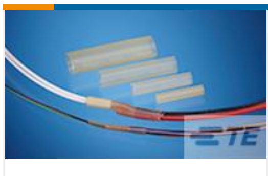
TE Part #CB88166002 RBK-VWS-125-NR1-X-100MM