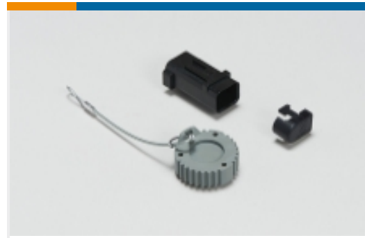
Automotive Connector Caps & Covers (107)