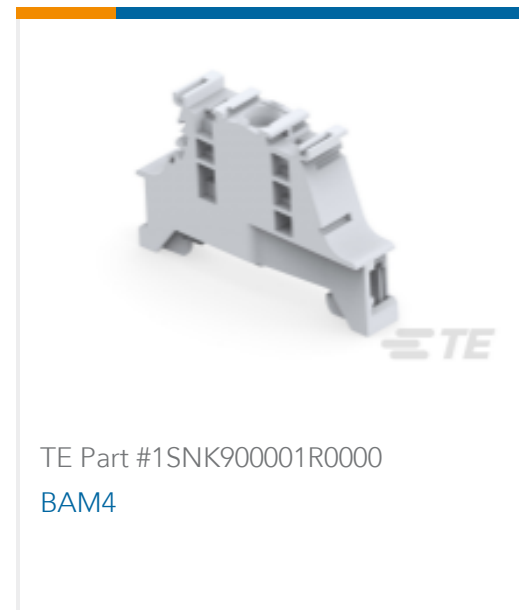
TE Part #1SNK900001R0000 BAM4