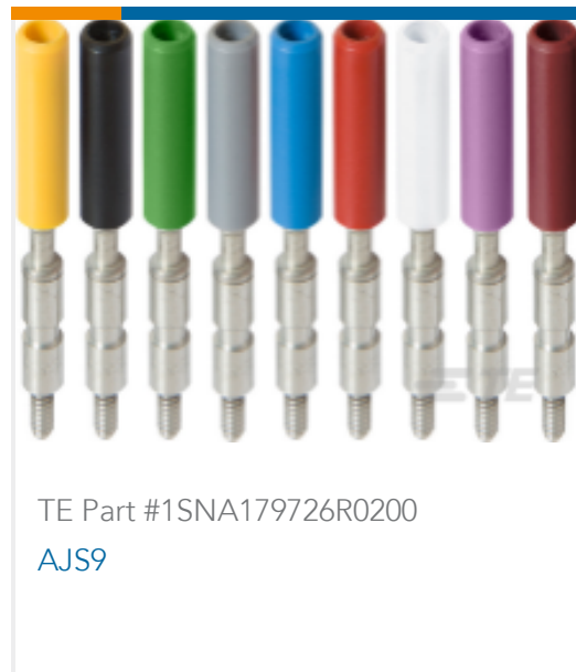
TE Part #1SNA179726R0200 AJS9