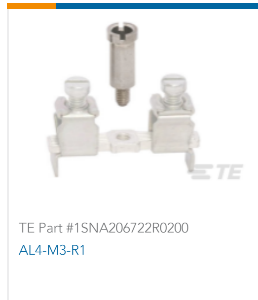
TE Part #1SNA206722R0200 AL4-M3-R1