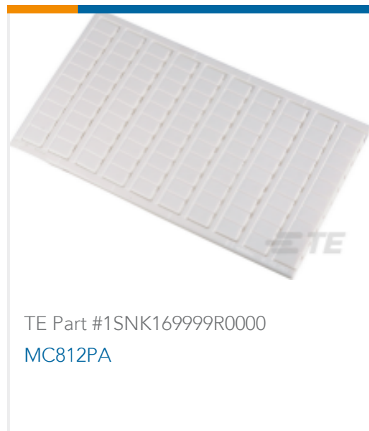
TE Part #1SNK169999R0000 MC812PA