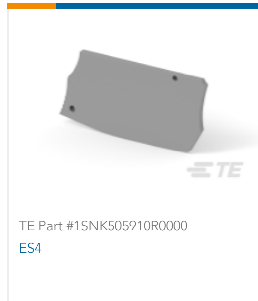
TE Part #1SNK505910R0000 ES4