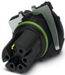
Flush-type connector, Power, 6-position, Socket, straight, M - Power, PCB mounting, THR solder connection

Please be informed that the data shown in this PDF Document is generated from our Online Catalog. Please find the complete data in the user's documentation. Our General Terms of Use for Downloads are valid ( http://phoenixcontact.com/download )