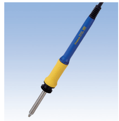
Heavy Duty Soldering Iron