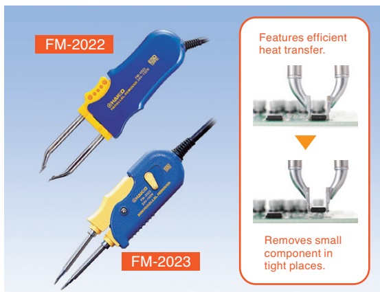
SMD Hot Tweezers