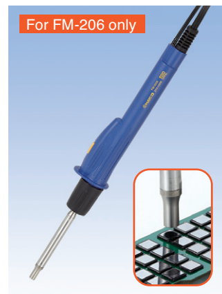
Hot Air Rework Pencil