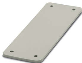
HEAVYCON cover plate, for panel cutouts of type B16/HV6, 3.5 mm thick, gray

Please be informed that the data shown in this PDF Document is generated from our Online Catalog. Please find the complete data in the user's documentation. Our General Terms of Use for Downloads are valid ( http://phoenixcontact.com/download )