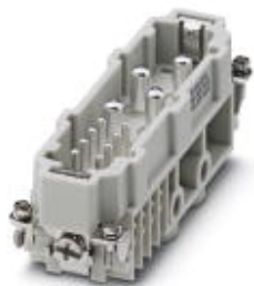
HEAVYCON male insert, K4/8 series, for 4 power and 8 control contacts, screw connection without wire protection

Please be informed that the data shown in this PDF Document is generated from our Online Catalog. Please find the complete data in the user's documentation. Our General Terms of Use for Downloads are valid ( http://phoenixcontact.com/download )