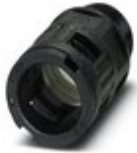
Cable gland, Pg thread, IP68/69k protection, straight

Screw connection - WP-G HF IP69K PG16 BK - 3240877