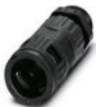
Cable gland, Pg thread, IP66 protection, with strain relief

Screw connection - WP-GR HF IP66 PG16 BK - 3240947