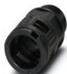
Cable gland, Pg thread, IP66 protection, straight

Screw connection - WP-G HF IP66 PG16 BK - 3240891