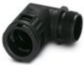
Cable gland, Pg thread, IP66 protection, angled

Screw connection - WP-GA HF IP66 PG16 BK - 3240919