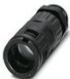
Cable gland, Pg thread, IP68/69k protection, with strain relief

Screw connection - WP-GR HF IP69K PG16 BK - 3240933