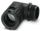
Cable gland, Pg thread, IP68/69k protection, angled

Screw connection - WP-GA HF IP69K PG16 BK - 3240905