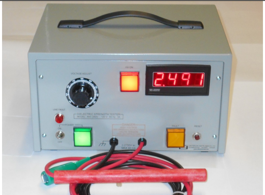
DIELECTRIC STRENGTH TESTER (HIPOT) MODEL AV-25DV-10

This Dielectric Strength Tester, is Ideal for testing: control panels, small transformers, electrical motors, appliances, light fixtures, short electrical cables and similar products.