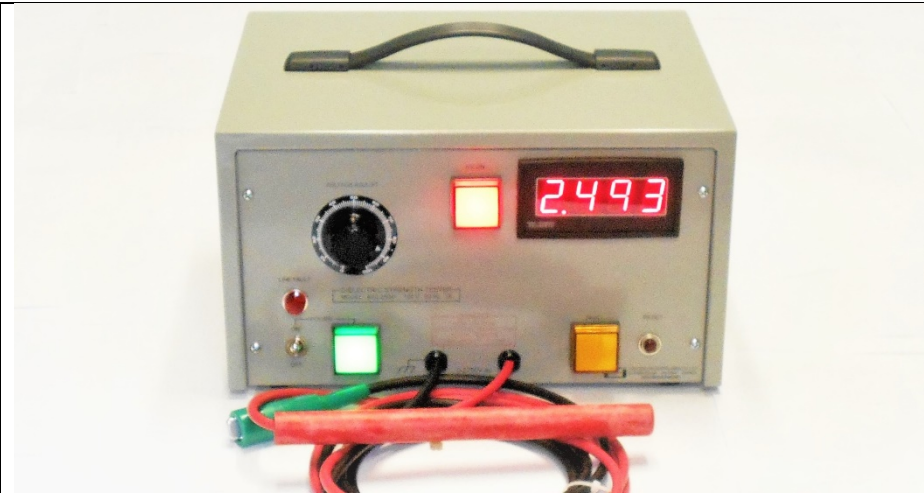
DIELECTRIC STRENGTH TESTER (HIPOT) MODEL DV-25DV-10

PAGE 5 of 6 This Dielectric Strength Tester, is Ideal for testing: Control panels with electronic circuits, appliances, light fixtures with electronic ballasts, electrical cables and similar Products.