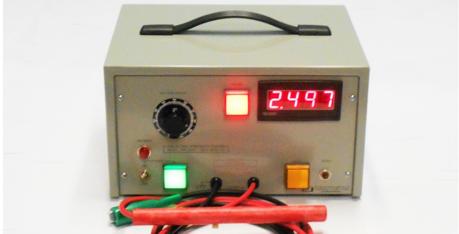
DIELECTRIC STRENGTH TESTER (HIPOT) MODEL AV-25DV-5

This Dielectric Strength Tester is ideal for testing: Control panels, small transformers, small electrical motors, appliances, light fixtures, short electrical cables and similar products.