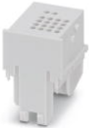
DIN rail housing, 2U for marking lid, Housing cover, width: 18.9 mm, color: light gray (7035)

Please be informed that the data shown in this PDF Document is generated from our Online Catalog. Please find the complete data in the user's documentation. Our General Terms of Use for Downloads are valid ( http://phoenixcontact.com/download )