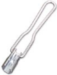
The illustration shows version QSS 22

Socket wrench, for tightening and unscrewing the QUICKON union nut, wrench size 19 mm