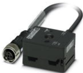
AS-Interface distributor with a high degree of protection, for a branch from one flat-ribbon conductor to a 1.0 m PUR round cable with straight M12-SPEEDCON socket

Please be informed that the data shown in this PDF Document is generated from our Online Catalog. Please find the complete data in the user's documentation. Our General Terms of Use for Downloads are valid ( http://phoenixcontact.com/download )