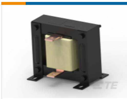
TE Part # 1-2432408-8 RPO-1-150