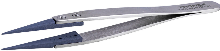
Replacement Tips Item: TIP-STD-4-CH