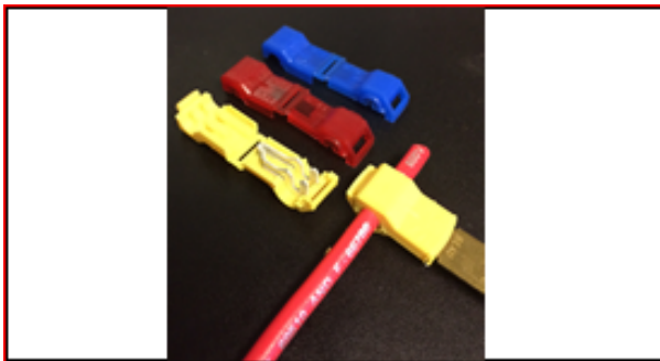
Three (3) Housings made from one (1) mold