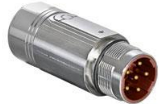
Contact Arrangement mating view

B KU A 145 NN 00 59 0200 000 B K A 145 N 00 59 0200 000