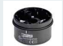
Order No. 2700091 Connection element with spring-cage connection