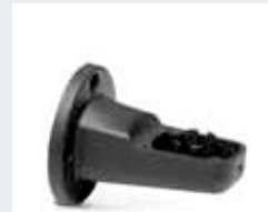
Order No. 2700160 Bracket for single-sided surface mounting