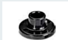
Order No. 2700164 Base for tube, Ø 25 mm, metal