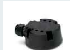
Order No. 2700153 Outlet box with lateral cable entry