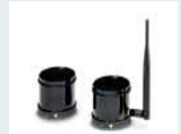
Order No. 2700683 Wireless multiplexer