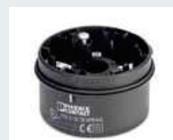
Order No. 2700092 Connection element with spring-cage connection