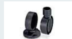
Order No. 2700151 Foldaway base, pitch 7.5°