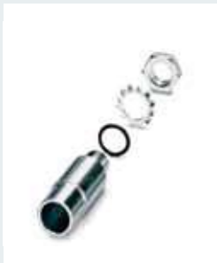
Order No. 2700150 Adapter for single-hole mounting