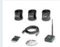
Order No. 2700679 WIN wireless system