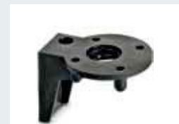
Order No. 2700143 Bracket for base mounting