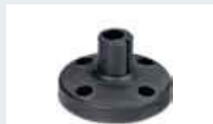
Order No. 2700163 Base for tube, Ø 25 mm, plastic