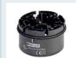
Order No. 2700095 Connection element with screw connection