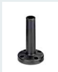
Order No. 2700156 Base with integrated tube, 110 mm long

250 mm Order No. 2700157 400 mm Order No. 2700158 1000 mm Order No. 2700154 Tube, Ø 25 mm