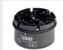
Order No. 2700093 Connection element with screw connection