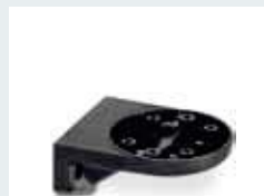
Order No. 2700149 Bracket for base mounting with hidden cable routing