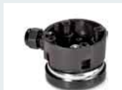
Order No. 2700155 Outlet box with magnetic base and lateral cable entry