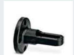
Order No. 2700161 Bracket for two-sided surface mounting