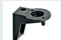
Order No. 2700144 Bracket for surface mounting