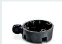
Order No. 2700153 Outlet box with lateral cable entry