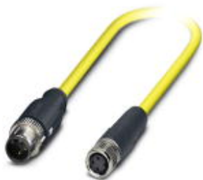
Sensor/actuator cable, 3-position, PVC, yellow, shielded, Plug straight M12 SPEEDCON, A-coded, on Socket straight M8, cable length: 0.5 m

Please be informed that the data shown in this PDF Document is generated from our Online Catalog. Please find the complete data in the user's documentation. Our General Terms of Use for Downloads are valid ( http://phoenixcontact.com/download )