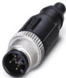
Terminating resistor CANopen®/DeviceNet™ M12

Please be informed that the data shown in this PDF Document is generated from our Online Catalog. Please find the complete data in the user's documentation. Our General Terms of Use for Downloads are valid ( http://phoenixcontact.com/download )