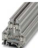
Double-level terminal block, with preassembled resistors

Component terminal block - UKK 5-2R/NAMUR - 2941662