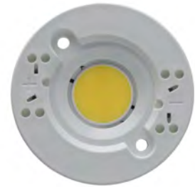
LED Array Holder for Sharp Mega Zenigata Array with Zhaga compliant cover (180330-0003)