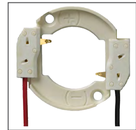
LED Array Holder for Mega Zenigata (COB) Array