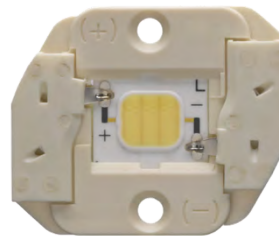
LED Array Holder for Sharp Mini Zenigata (180390-0002)