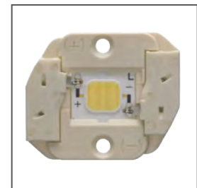
LED Array Holder for Mini Zenigata (COB) Array