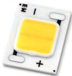
Sharp Mini Zenigata Array