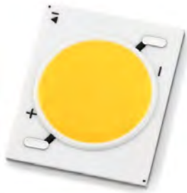
Sharp Mega Zenigata Array