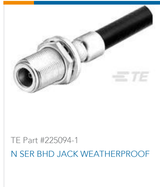
TE Part #225094-1 N SER BHD JACK WEATHERPROOF