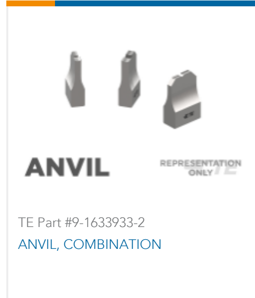
TE Part #9-1633933-2 ANVIL, COMBINATION