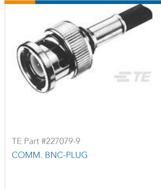
TE Part #227079-9 COMM. BNC-PLUG