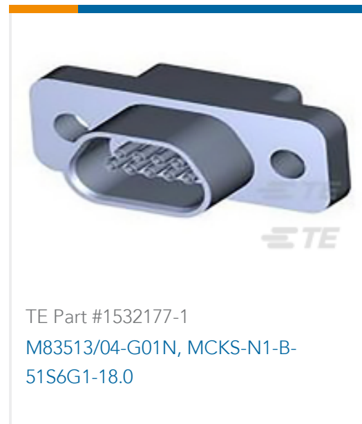
TE Part #1532177-1 M83513/04-G01N, MCKS-N1-B- 51S6G1-18.0