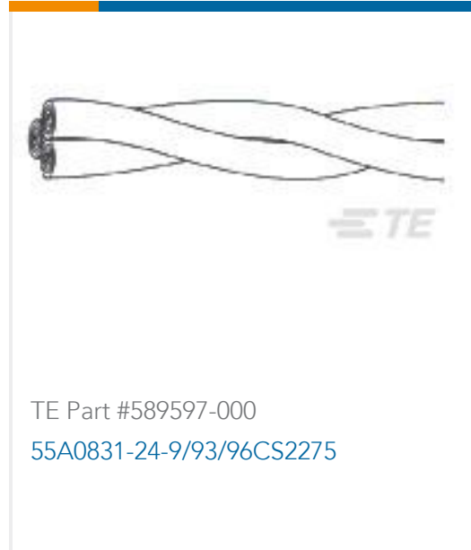
TE Part #589597-000 55A0831-24-9/93/96CS2275