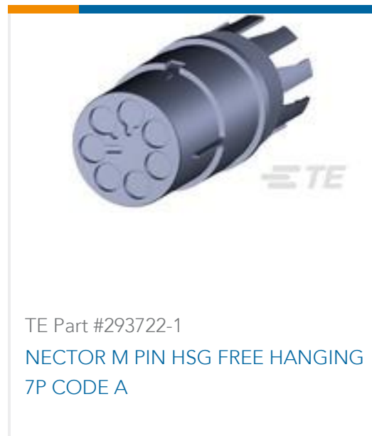
TE Part #293722-1 NECTOR M PIN HSG FREE HANGING 7P CODE A