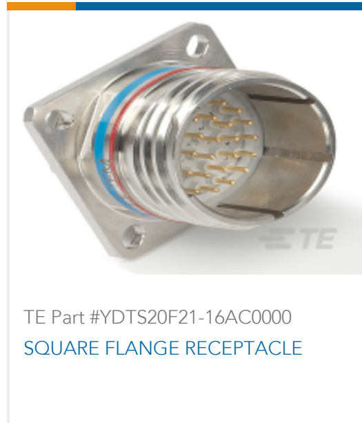
TE Part #YDTS20F21-16AC0000 SQUARE FLANGE RECEPTACLE