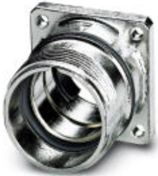
Panel mounting base, straight, Screw locking, M23, Axial O-ring, 4x Ø 3.2, shielded: yes

Please be informed that the data shown in this PDF Document is generated from our Online Catalog. Please find the complete data in the user's documentation. Our General Terms of Use for Downloads are valid ( http://phoenixcontact.com/download )