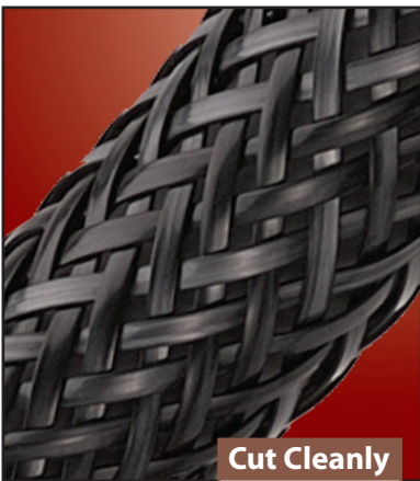
Cut Cleanly Hot Knife