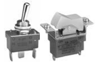
Changes for S Toggles & SW Rockers

I. The location of production will change for specific S Toggles and SW Rockers from the Japan factory to the Philippines factory. The factory name and place of manufacture will no longer appear on the bottom of switches, and the lot number on the side of switch cases will have a dot mark above the second digit. The box in which the switches are packaged for shipping will read "PHILIPPINES FACTORY" instead of "JAPAN FACTORY." All of these modifications will apply to standard, custom and UL/CSA approved products.