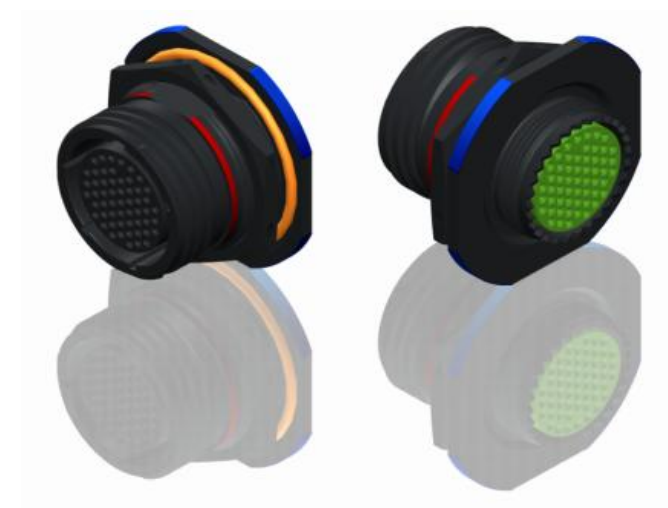
LAYOUT SHOWN AS EXAMPLE