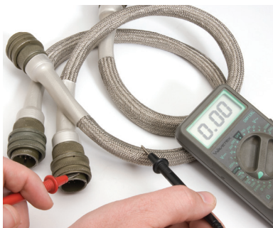
Flexo® Shield can provide end-to-end shielding solution on your application.