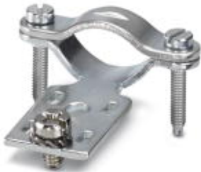
Strain relief clamps contact inserts of series: B-, BB-, D 40, D 64, DD and HV, straight cable exit

Please be informed that the data shown in this PDF Document is generated from our Online Catalog. Please find the complete data in the user's documentation. Our General Terms of Use for Downloads are valid ( http://phoenixcontact.com/download )