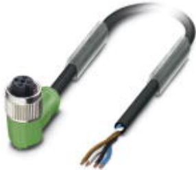
Sensor/Actuator cable, 4-position, PUR, Yellow RAL 1021, Free cable end, on Socket angled M12, Cable length: 5 m

Please be informed that the data shown in this PDF Document is generated from our Online Catalog. Please find the complete data in the user's documentation. Our General Terms of Use for Downloads are valid ( http://download.phoenixcontact.com )