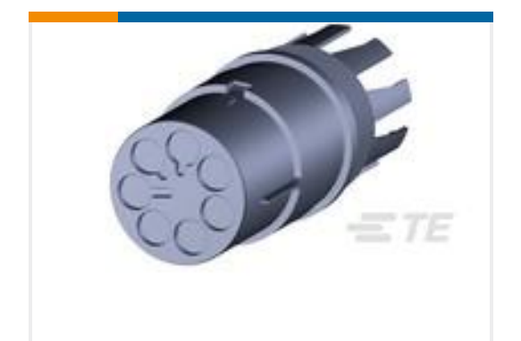
TE Part #293722-1 NECTOR M PIN HSG FREE HANGING 7P CODE A