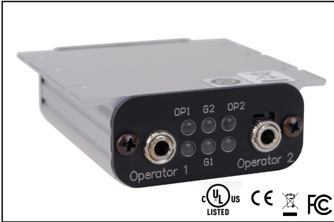
Figure 1. SCS 773 Wrist Strap and Ground Monitor