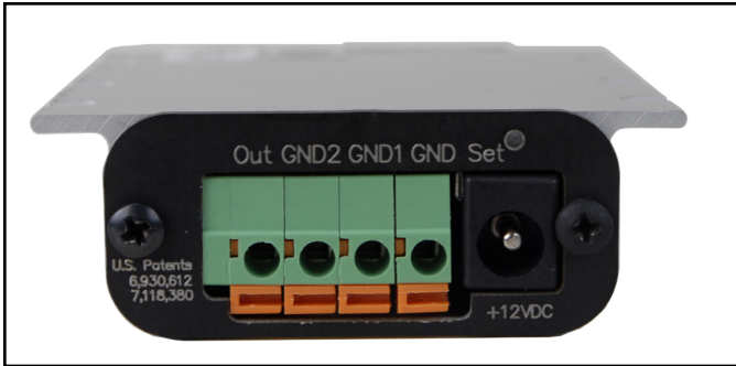
Figure 2. Rear view of Wrist Strap and Ground Monitor