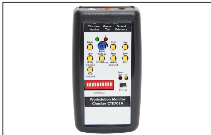
Figure 3. SCS CTE701 Workstation Monitor Checker

The checker verifies the proper operation of dual wrist strap monitoring. Connect a 3.5 mm test cable to both the checker and to the operator jack of the monitor. At this point the monitor should indicate failure. Depress the Pass button on the wrist strap section. The monitor should indicate a good connection. While pressing the Pass button, press body voltage “high.” At this point the Wrist Strap LED would be blinking red.