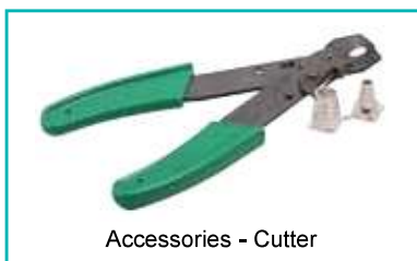
Accessories - Cutter