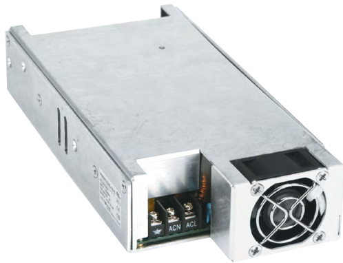
3.86"W x 8.03"L x 1.57"H