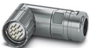
The figure shows the 12-pos. product version with solder contacts

Cable connector, angled, shielded: yes, Screw locking, M23, No. of pos.: 17, type of contact: Pin, Crimp connection, cable diameter range: 3 mm ... 14.5 mm