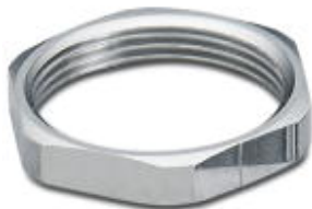
M18 x 0.75 locking nut

Please be informed that the data shown in this PDF Document is generated from our Online Catalog. Please find the complete data in the user's documentation. Our General Terms of Use for Downloads are valid ( http://phoenixcontact.com/download )