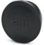
Plastic dust protection cap, anti-static, for RF, SF series connectors, with M23 external thread

Plastic anti-static dust protection cap - RC-Z2469 - 1611797