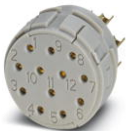
Contact insert, number of positions: 12, type of contact: Socket, Solder connection

Please be informed that the data shown in this PDF Document is generated from our Online Catalog. Please find the complete data in the user's documentation. Our General Terms of Use for Downloads are valid ( http://phoenixcontact.com/download )