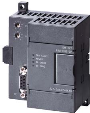
SIMATIC S7-200, PROFIBUS DP Slave module, 9.6 KB to 12 MB, 1 interface PROFIBUS-DP/MPI