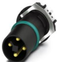
Flush-type connector, Power, 4-position, Plug, straight, M12, T power, PCB mounting, THR solder connection

Please be informed that the data shown in this PDF Document is generated from our Online Catalog. Please find the complete data in the user's documentation. Our General Terms of Use for Downloads are valid ( http://phoenixcontact.com/download )