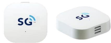
Figure 1. SGW8130 Sensor Tag