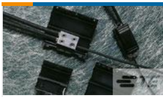
TE Part #566427-000 GTAP-1(B18)