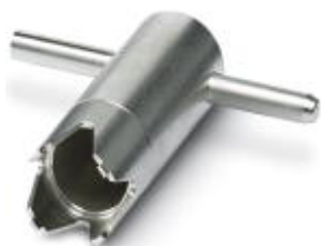
Special pipe wrench, tool for mounting the M23 coupler connector housing for assembly

Please be informed that the data shown in this PDF Document is generated from our Online Catalog. Please find the complete data in the user's documentation. Our General Terms of Use for Downloads are valid ( http://phoenixcontact.com/download )