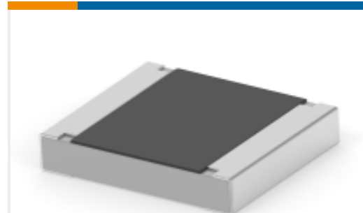
TE Part #1-2176346-3 CRGCO 1210 100R 5%