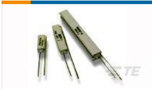
TE Part #1623728-9 BCHE 11 W 1R0 10%