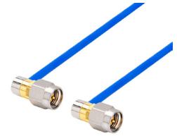
Generic photo used for illustration purposes only