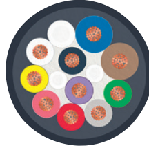
PUR/PVC black [PUR]